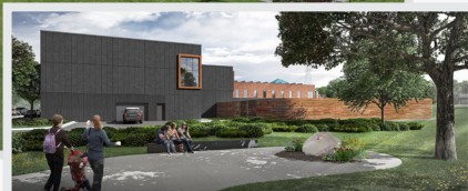
Renderings of the future Oakdale Police facility