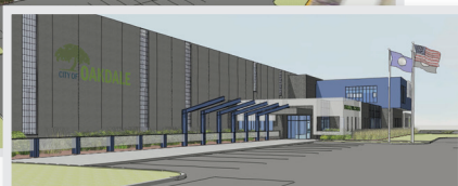
Renderings of the future Oakdale Public Works facility

Both City questions on the November 8 ballot related to a local option sales tax increase for two facility projects were approved by Oakdale voters.