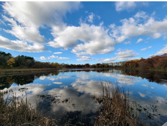
“Reflections” by Tim Kemper

Winter photo nominations will be accepted February 1 to 28. Spring photo nominations are open May 1 to 31. For more information on contest details, entry rules, voting and judging, and how to submit photos, go to: www.oakdalemn.gov/905/Photo-Contest