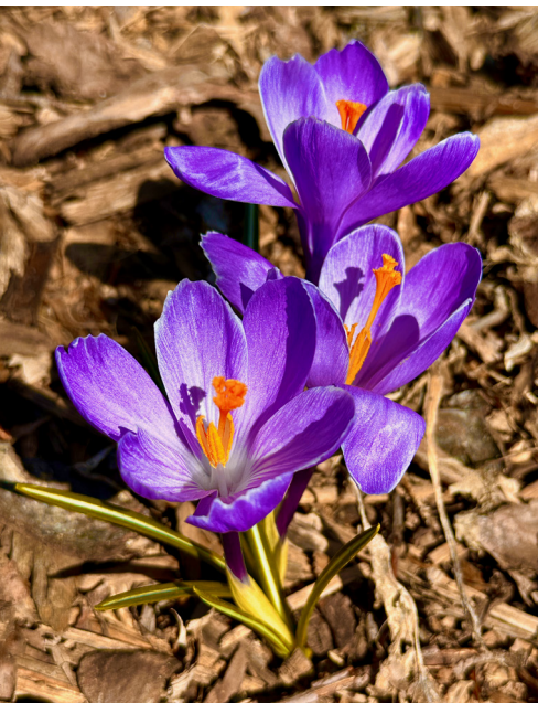
“Spring Has Sprung” by Stan Blanda

Summer contest voting ends September 30. Nominations for the fall contest will be open November 1 to 30, and voting begins December 11. For more information on contest details, entry rules, voting and how to submit photos, visit www.oakdalemn.gov/905/Photo-Contest .