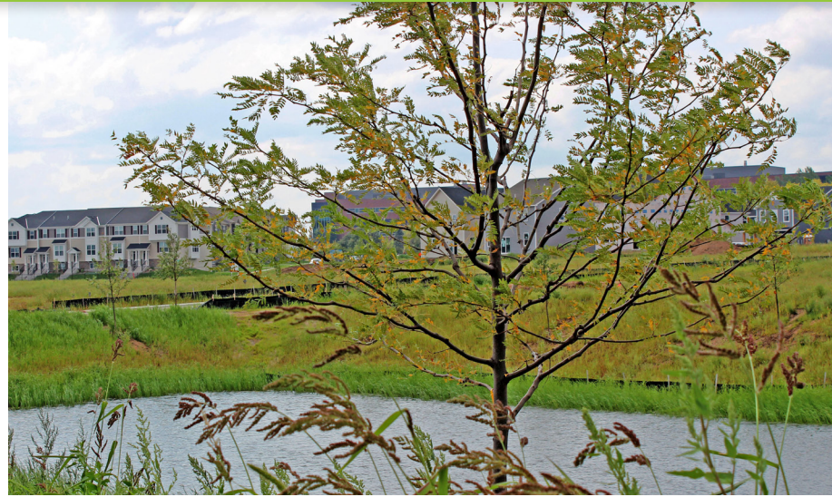
Over 200 new trees were planted in Willowbrooke in mid-August.

The City's reconstruction of 40th Street N concluded at the end of June following delays due to weather in the