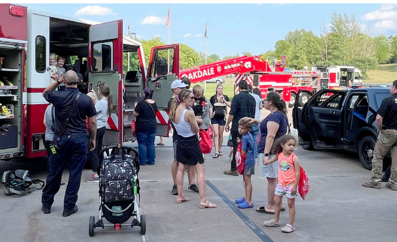
Above: Families wait to explore an Oakdale Fire vehicle. Right: Two children try on Washington County police gear.

The City of Oakdale Fire and Police departments teamed up to host the first-ever Ladders and Squads on July 13. This interactive event allowed kids to touch, explore and learn about vehicles and equipment used by public safety agencies including several fire trucks and ambulances, fire hoses, police cruisers, safety vests and helmets, and a Washington County SWAT vehicle. The overwhelming reception and success of this engaging inaugural event has guaranteed Ladders and Squads will become an annual activity for the community to enjoy each summer.