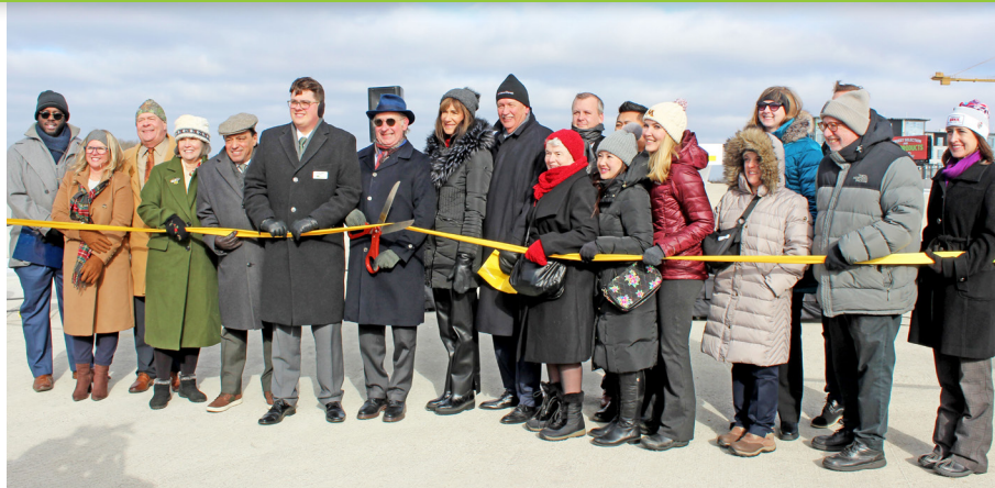
Local government officials from the state, county and city levels gathered for the Bielenberg Bridge ribbon cutting hosted by Metro Transit and the Metropolitan Council on November 27.

Following a busy construction season, work in Oakdale has paused until later this spring. Planned 2024 construction for the Gold Line includes reconstruction of the 4th Street N bridge as well as work along the route near Hadley Avenue N, Hudson Boulevard N and Helmo Avenue N. Private development near the future Helmo and Greenway Stations will also continue.