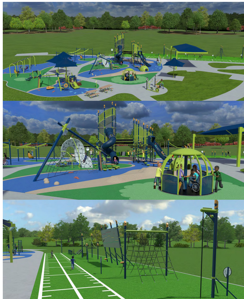
Renderings for the future City park in the Willowbrooke neighborhood show an aerial view of the playground (top), inclusive and accessible play features (middle), and teen challenge course (bottom).