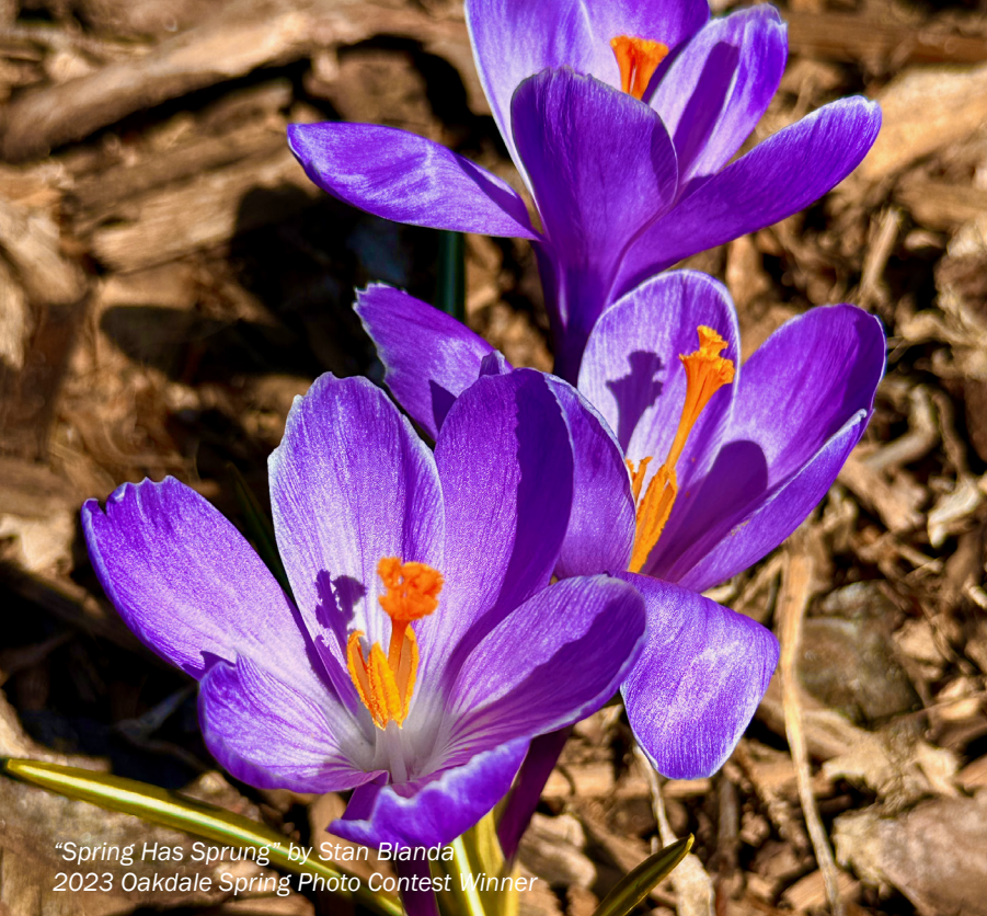
"Spring Has Sprung" by Stan Blanda 2023 Oakdale Spring Photo Contest Winner