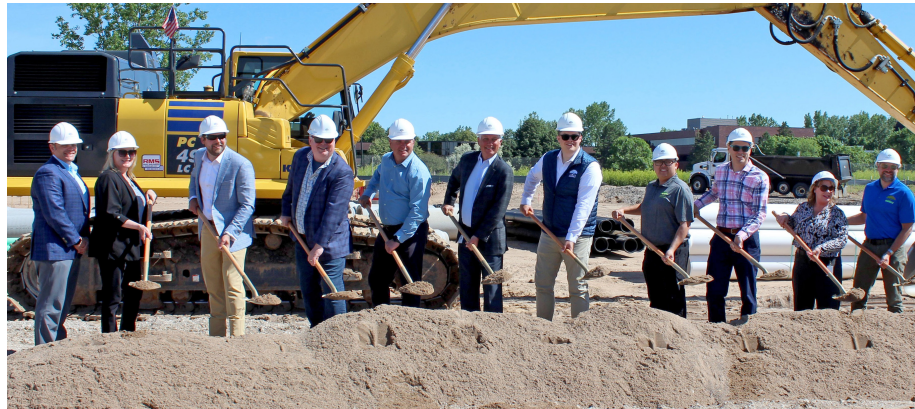
Above: City staff and officials attended a groundbreaking for Aldi and Starbucks on June 10.