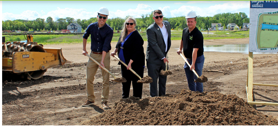
City Council Members celebrate the groundbreaking of Willowbrooke Commons on May 28.

Following great success in 2023, the Business Retention, Expansion and Attraction (BREA) program was launched for a second year in February. In partnership with the Oakdale Area Chamber of Commerce (OACC) and the St. Paul Area Chamber, City of Oakdale staff and officials visit local businesses to help build and strengthen relationships, to connect businesses with resources to support growth and success, and to develop an understanding of how to create and maintain a business-friendly environment in Oakdale.