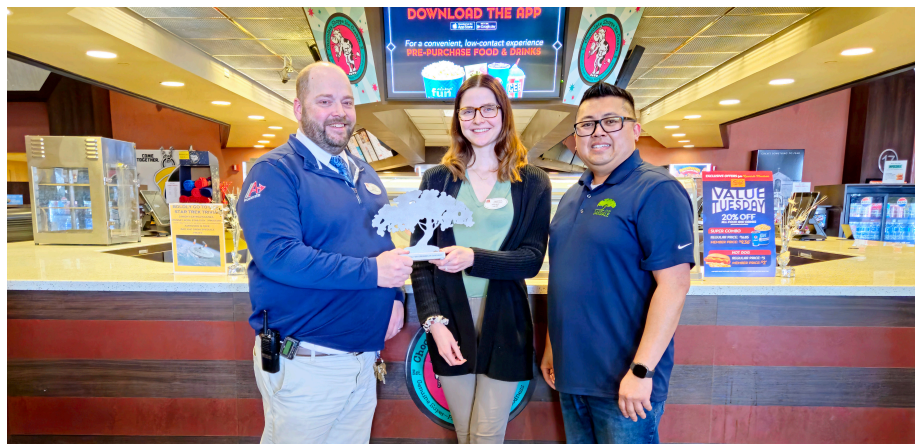
Below: City officials visit with local businesses as part of the Business Retention, Expansion and Attraction (BREA) program.