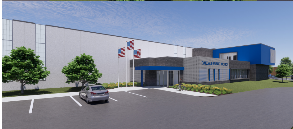
Top: Aerial rendering of new Public Works facility from the north. Bottom: Rendering of new Public Works facility public entrance.