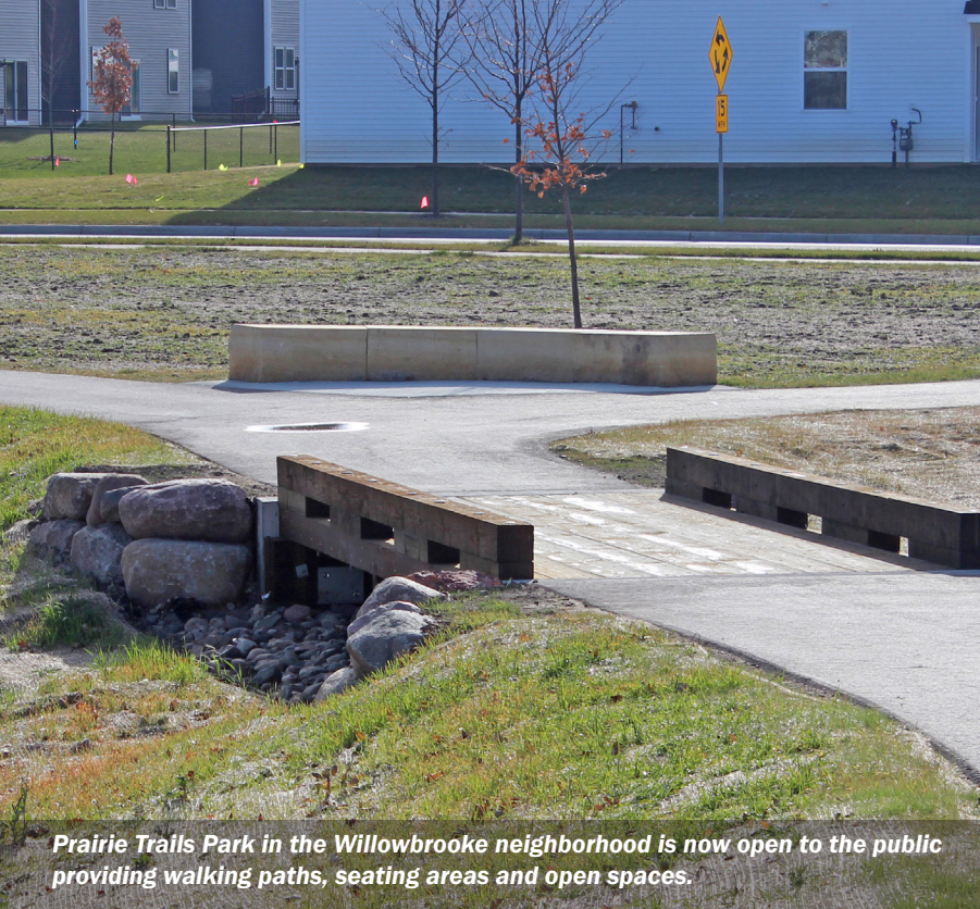
Prairie Trails Park in the Willowbrooke neighborhood is now open to the public providing walking paths, seating areas and open spaces.