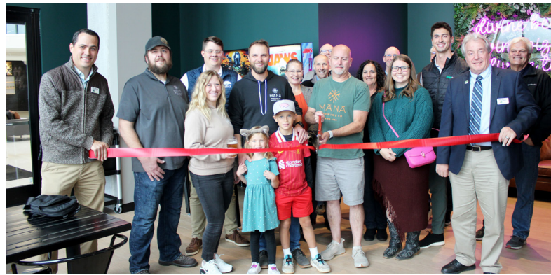
City officials attended a ribbon cutting ceremony for Oakdale's first brewpub, Mana Brewing, on October 30.