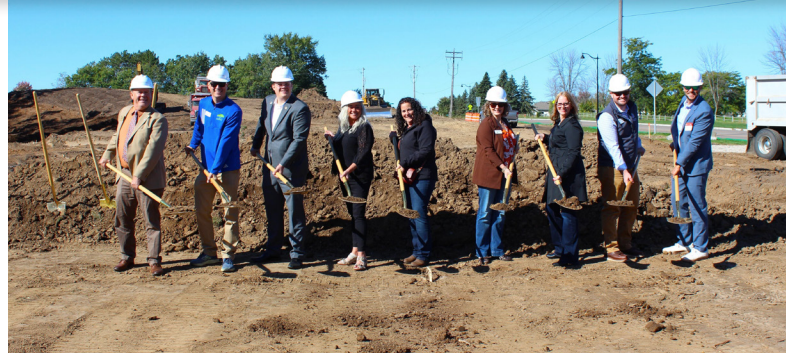
City officials participated in a groundbreaking ceremony for Estoria Oak Marsh on October 8.