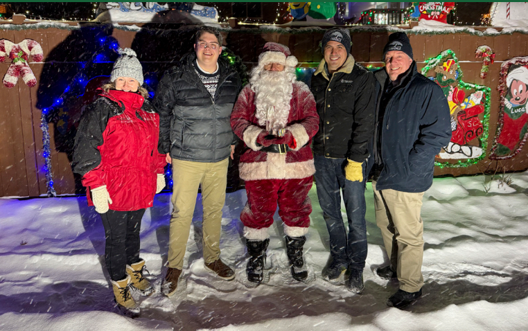
“Oakdale Santa” was recognized by the City Council at Hadley Avenue N and Stillwater Boulevard on December 8.