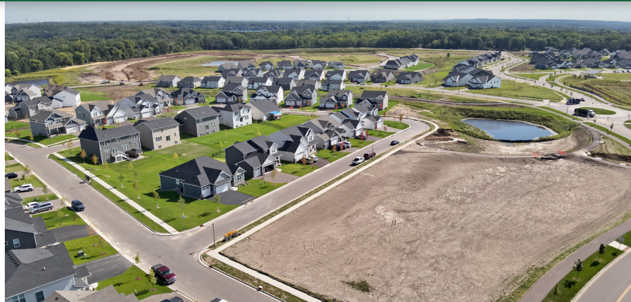
Seventy percent of the Willowbrooke development (top) includes homes under construction or completed.

The Willowbrooke development will soon feature two more parks in addition to Willowbrooke Commons which opened in October 2024. Willowbrooke Park North will serve as a passive, open space with trails and seating areas and is anticipated to open in 2026. Willowbrooke Park West is also slated for a 2026 opening and will be an active park with a soccer field, pickleball courts and synthetic turf volleyball court.