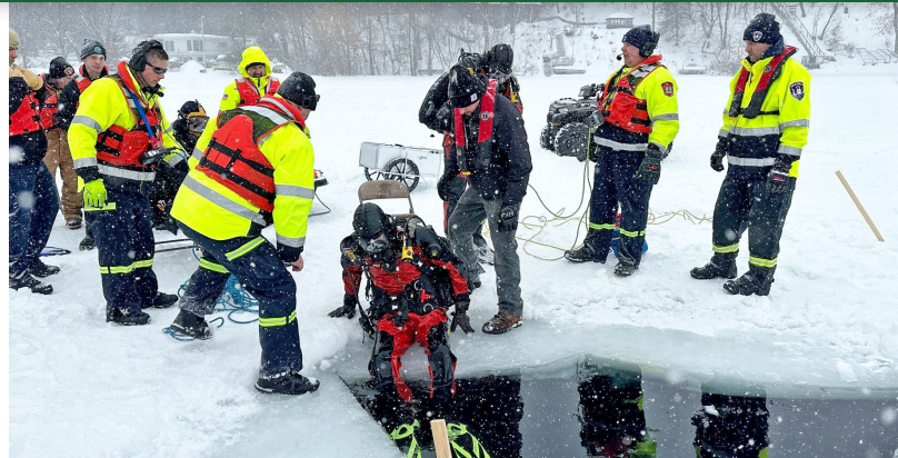
Members of the Washington County Dive Team practice winter weather rescue drills (top).