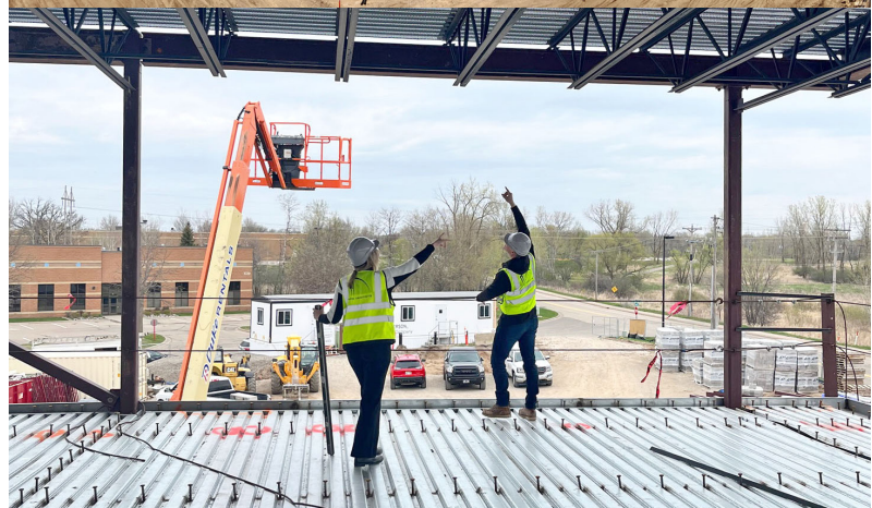
Completion of exterior walls took place this summer (top). Framing for interior walls of the office area began this spring (bottom).