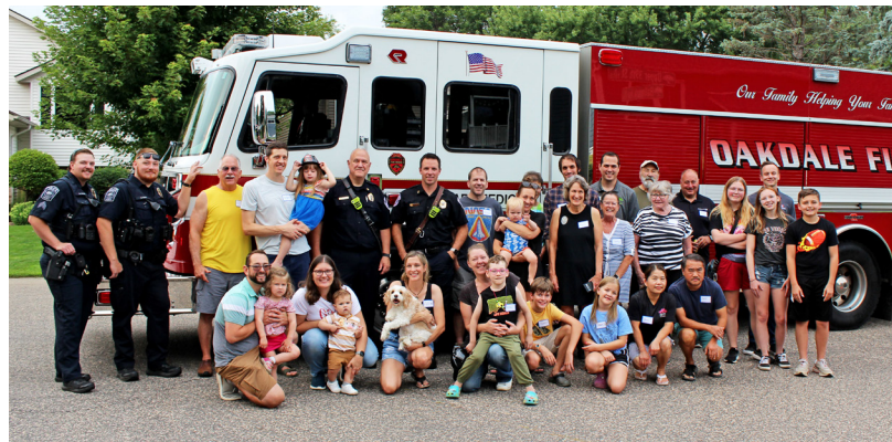
Night to Unite featured neighborhood parties (center) and a community cookout at Walton Park (bottom).