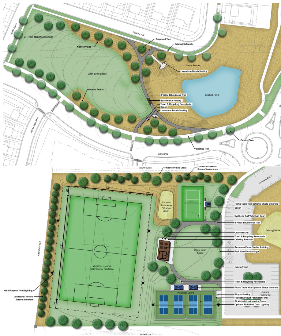
Concept plans for two additional parks in Willowbrooke were approved in March. Both the north park (center) and west park (bottom) are slated for 2026 openings.